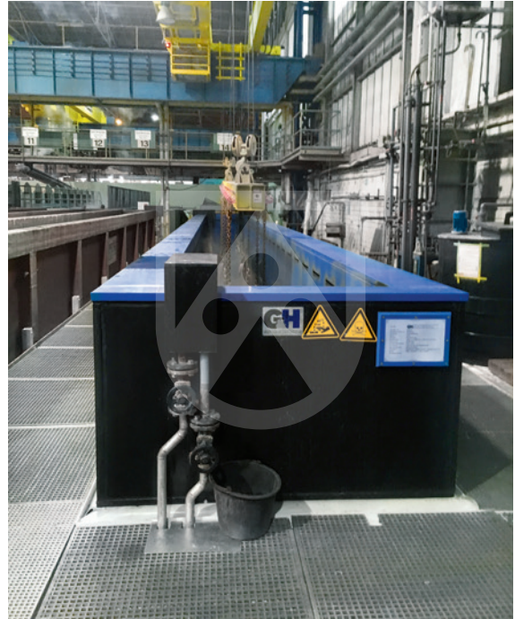
Exterior cladding made from Polystone® G blue B 100-RC: The material is suitable for permanent contact with aggressive nitric and hydrofluoric acids and contributes to the plant's high operational safety and performance