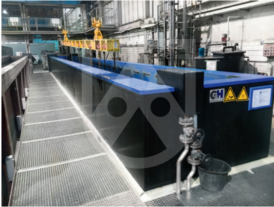
Pickling line for seamless tubes at Mannesmann Stainless Tubes Deutschland GmbH in Remscheid/Germany: A pickling medium with up to 18 % nitric acid and 7 % hydrofluoric acid is used