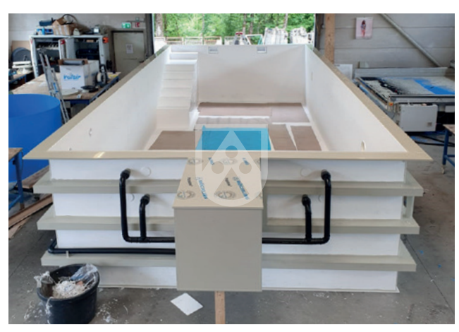
Rectangular swimming pool designed using sheets made of Polystone® P PG