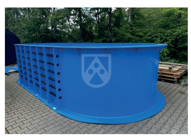
Round swimming pool made of blue Polystone® P PG sheets, Image: Klees & Fröhlich GmbH