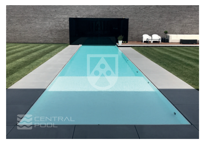
Swimming pool made from Polystone® P PGX sheets, Image: CENTRAL-POOL