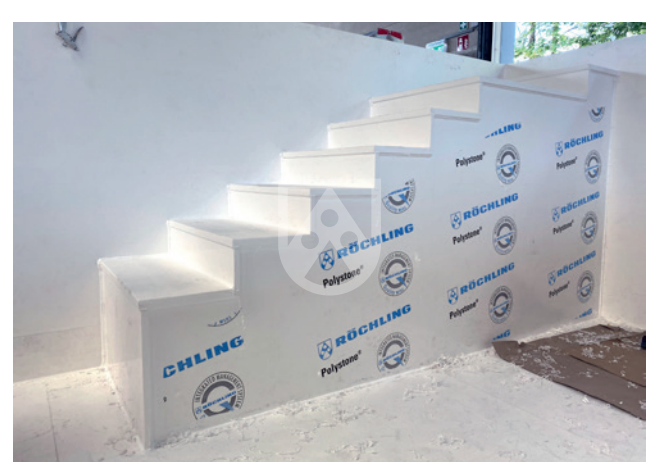
Stairway made of Polystone® P PG sheets, Image: Klees & Fröhlich GmbH