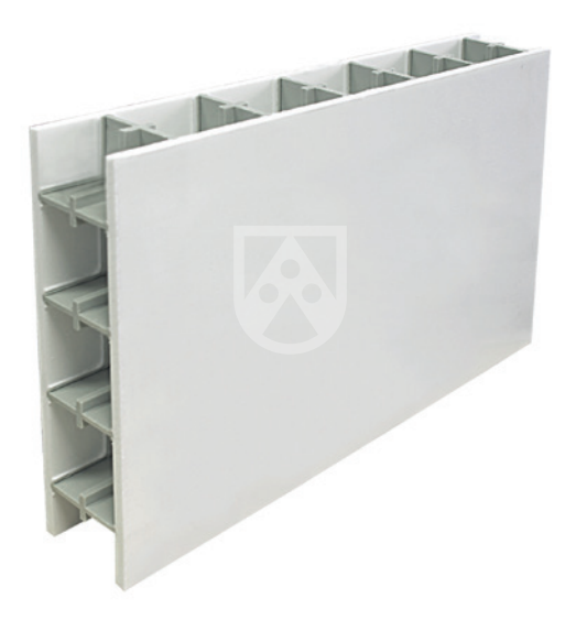
Polystone® P CubX® PG-UV stabilized white: permits the reduction of steel reinforcements by up to 100%

We developed Polystone® P CubX® PG-UV stabilized white specifically for the requirements of pool design. The white, UV-stabilized cover sheet can be used to realize visually high-quality pools having a high resistance to UV and, depending on the design, completely dispensing with steel reinforcements. The use of PP reinforcements, which are often welded on at the outside, can also be significantly reduced, depending on the design, in turn reducing processing time.