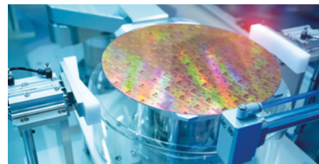
↑ Front-End applications: Handling process

As a manufacturer of highly sensitive IC chips, two aspects are particularly important: Your equipment must meet the highest standards and your production processes and systems must be suitable for the chip manufacturing processes. We support you with a wide range of thermoplastic materials that are precisely tailored to your individual requirements.